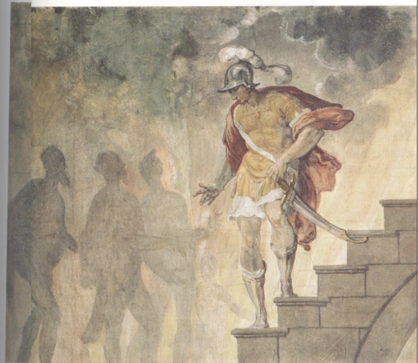
Ulysses Descending into the Underworld (16th century), Giovanni Stradano. Fresco. Palazzo Vecchio, Florence.

In lines 17–20, Odysseus makes a sacrifice to “sovereign Death,” or Hades, and “pale Persephone” (pə-r-sĕf’ə-nē), his bride, who was kidnapped and forced to live with him for six months of every year. Her mother, goddess of the harvest, grieves during that time, causing winter to fall. What does this background information tell you about Hades? Consider how this information affects your impression of the underworld.